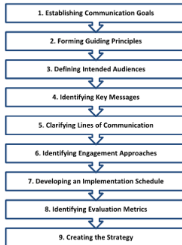
Figure 1: Strategy Development Process

This Community Awareness Strategy provides a framework for advancing NRRM's public engagement program in 2016, and setting the stage for ongoing communication. The Strategy was developed by NRRM staff in alignment with steps shown in Figure 1.